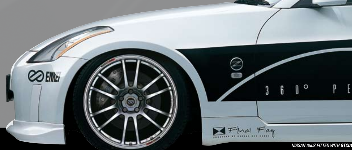
NISSAN 350Z FITTED WITH GTC01